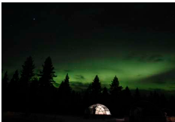
△ Overnight: Kakslauttanen Glass Igloo Resort

Note: Due to unsuitable weather conditions (e.g. there is no snow or it is raining), the husky ride will be replaced with another alternative - perhaps horse drawn carriage.