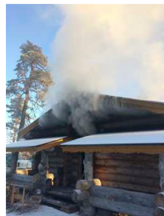
△ Overnight: Kakslauttanen Glass Igloo Resort

Early evening we will experience an authentic & traditional Smoke Sauna and ice pool! This sauna is quite different from the ones we usually encounter, as it is fired with wood and the smoke penetrates the room and warms it up and is released just before the sauna is ready. This is the traditional way a sauna was heated many decades ago. It is very healing and a perfect way to complete our journey to the Arctic Circle.